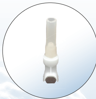
CONNECTOR for Oosafe® Filters 8 mm diameter soft tubing Product reference: AS-852085