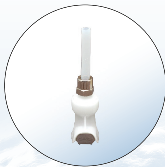
CONNECTOR for Oosafe® Filters 6 mm diameter hard tubing Product reference: AS-852086