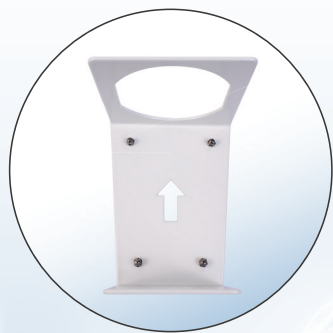
MAGNET HOLDER for Oosafe® Filters Product reference: OOHLD-01