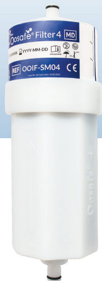
Oosafe® FILTER 4 (Replace every 4 months)