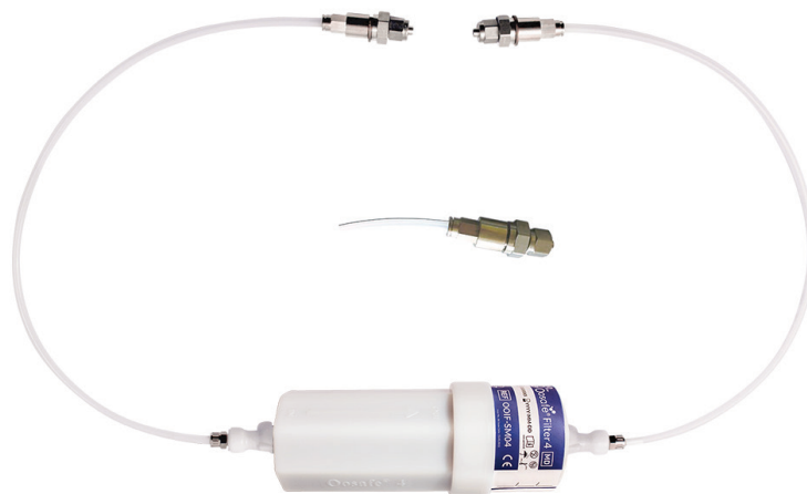
OOSAFE® FILTER CONNECTION SET FOR BENCHTOP INCUBATORS Product reference: OOFCS-MC